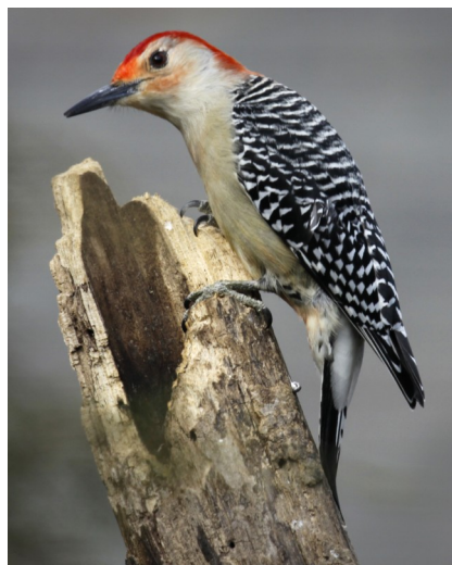
Red-bellied Woodpecker