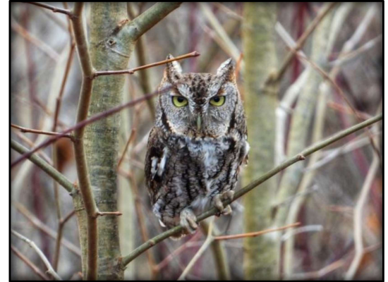
2026 Cover photo Eastern Screech Owl